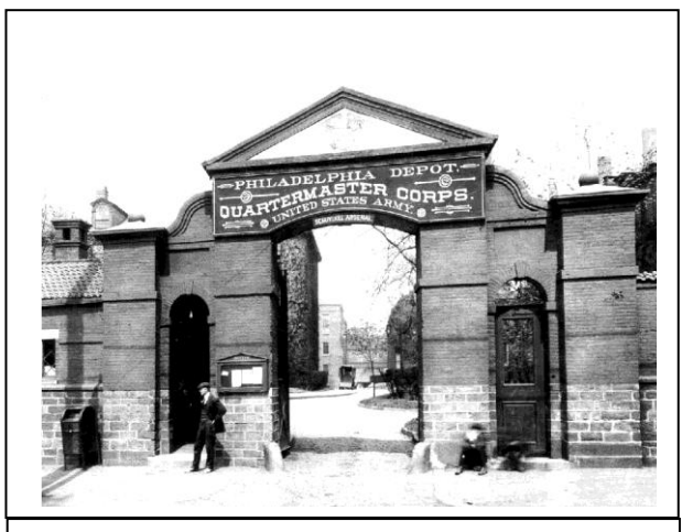
The Philadelphia Depot was home to the first Quartermaster School.

With this reorganization, the Army created entire Quartermaster units for the first time. Previously, the Army relied upon contracted services to do much of the actual work, especially moving supplies. Performance of contractors was irregular, especially overseas or in war. Now, the Army believed that trained military units were the most reliable means of providing vital supplies and services.