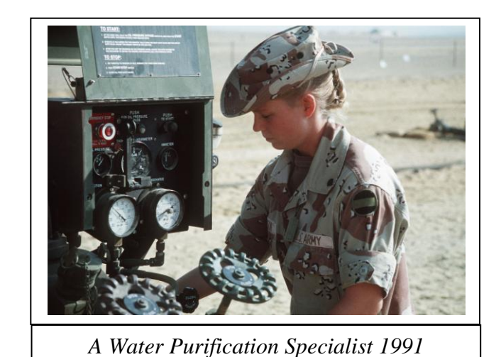
In August 1990, Iraq invaded and annexed the nation of Kuwait. In response, the United States led a coalition force to liberate Kuwait. Once again, Quartermaster Soldiers supported the effort. By this time, modern tanks and other vehicles consumed an enormous amount of fuel. Total fuel consumption for this conflict exceeded two million gallons. In addition to using host

The end of the Cold War did not result in an era of peace. For the next twenty years, the U.S. Army, and its allies, engaged in a variety of operations, ranging from major combat, to peacekeeping, to humanitarian assistance. Quartermaster Soldiers supported the Army through all of these operations. Usually, they worked with other logistical branches or with other services and often worked with other nations.