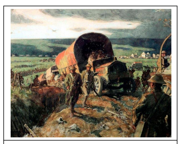
Lessons learned from the Spanish American War improved the Quartermaster performance in World War I

disease. The effectiveness of this logistical support was largely a result of the reforms after the Spanish American War.