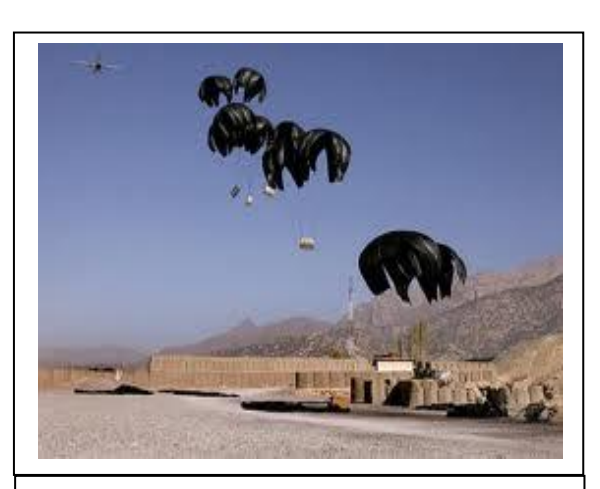
Using low cost parachutes to deliver supplies in Afghanistan

As part of the logistical community, Quartermaster Soldiers supported these operations under difficult circumstances. In Iraq, they faced the constant danger of convoy operations in support of distant bases. Other Soldiers operated an Inland Petroleum Distribution System, which was basically a pipeline system assembled in the combat zone. In Afghanistan, the high altitudes and poor roads made logistical support even harder. Aerial delivery once again became a principal means of resupply. Quartermaster personnel developed a low-cost, disposable parachute to reach isolated outposts. Once again they developed new solutions to tough problems.