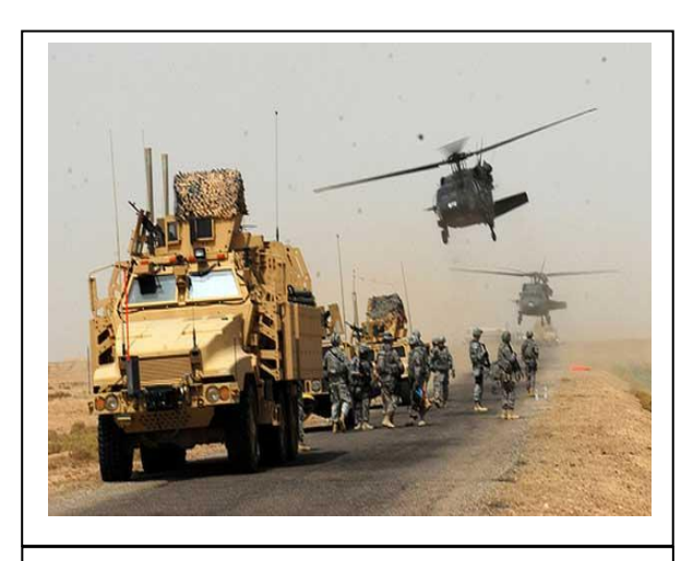
Convoy operations in Iraq