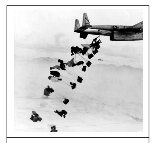
Aerial Delivery in Korea 1951

After World War II ended, the American public hoped for an era of peace. That was not the case. The rise of the communist threat in the Soviet Union and China created a period of armed tensions known as the "Cold War." Both the communist and the free world remained ready to go to war on short notice. The United States based troops in Europe and Asia, and remained ready to reinforce these forces. Quartermaster Soldiers supported the Cold War at almost all levels. This was the first time that the United States stationed units in Europe and Asia on a long-term basis, and Army logisticians learned how to support units overseas. They maintained depots with reserve supplies in case fighting broke out. Within the United States, they supported an enlarged Army.