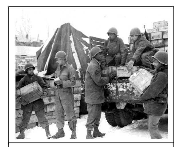
Unloading supplies in Europe 1944

Across the conflict, logisticians learned how to support the Army's offensive operations. In Europe, the success of Allied attacks meant that supply lines steadily grew longer and the strain on the truck convoys increased. Eventually, the supply lines stretch too far and the Allied offensive paused to allow the supplies to catch up. Success in the Pacific depended upon delivering the correct quantity of supplies to the units on various islands.