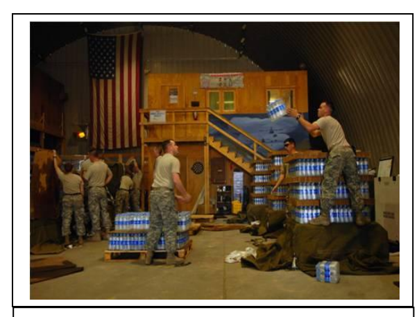
Distributing water in Afghanistan

Other changes came to all of the logistical branches. Increasingly, sustainment units consisted of Quartermaster, Ordnance, and Transportation units performing multiple functions. Officers and senior non-commissioned officers needed to understand all the support functions. Starting in 2008, the Army created the Logistics Branch for senior captains and above. New lieutenants still enter the Army in one of the three branches, but after finishing the captains' career course they will change to the Logistics Branch. Enlisted and warrant officers still keep their Quartermaster Branch.