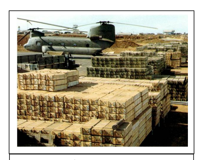
Depot Operations in Vietnam

From the mid 1960s to the early 1970s, the United States tried to prevent the communist takeover of South Vietnam. During these years, the Vietnam Conflict overshadowed all other military activity. Although the sudden build-up created logistical confusion at first, the military developed a solid logistical structure over time. Quartermaster units provided subsistence, petroleum, other supplies, and field services on a steady basis. The excellent ports and short supply lines allowed for plentiful support to the soldiers.