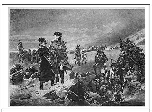
Valley Forge was only one example of hardships endured during the American Revolution

Unfortunately, the new nation lacked the means to pay for the Army. Sustainment suffered without enough money. Hardships suffered by the Soldiers at Valley Forge in 1777 are well known; but other winters were equally bad. It took time for the Quartermaster Department to develop the logistical organization. Over time, the sustainment support to the Revolutionary War Soldiers did improve.