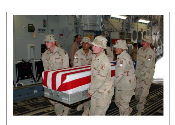
Taking care of the fallen Soldiers