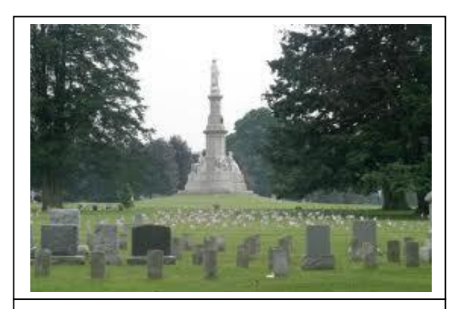
Civil War cemeteries marked the beginning of the Mortuary Affairs mission for the Quartermaster Corps

Moving these huge armies was a difficult task. The mules used to pull the wagons consumed so much food that Armies could not move far from their bases. Once again Quartermasters learned how to adapt to the scale of the Civil War. They used a system of depots to support armies on the move. They also learned how to use railroads and steamboats whenever possible.